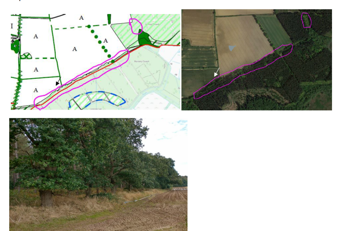
*as an aside, the scarce arable plant corn spurrey Spergula arvensis was noted in the arable field margins at the location this photograph was taken, supporting comments made to the examination previously by myself and others that the sandy arable habitats in the MDS may warrant a higher score than the low default they are given in Metric 2.0.

Cumulatively, these types of woodland classification error amount to several hectares of habitat that will be lost to the proposals being undervalued in the metric calculations. The effect of such errors on the Applicant's metric outputs is discussed later in this submission.